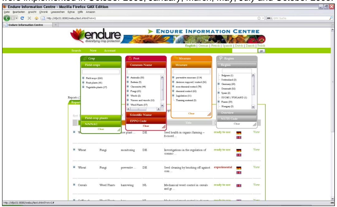
Figure 2: ENDURE IC search screen

The search screen and its functionalities have been improved several times. Improvements were implemented in October 2008, January, March, May, July and October 2009.