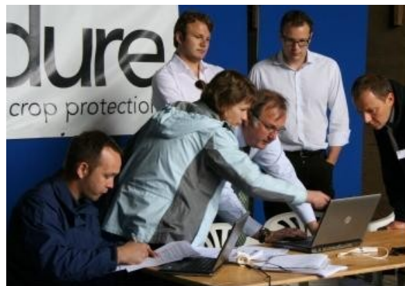
ENDURE's Information Centre will be presented in Interactive Workshop Room 1 from 14.30.

On Thursday (November 25), ENDURE's resources for IPM research will be presented from 11.30 through to 16.45 in Interactive Workshop Room 2. Visitors will be able to explore the research tools and resources housed by ENDURE's Virtual Laboratory. These include EuResist, Weeds Trait Database, UniSim, QuantiPest and WheatPest. Also on show will be tools developed for extension services, such as EuroWheat.