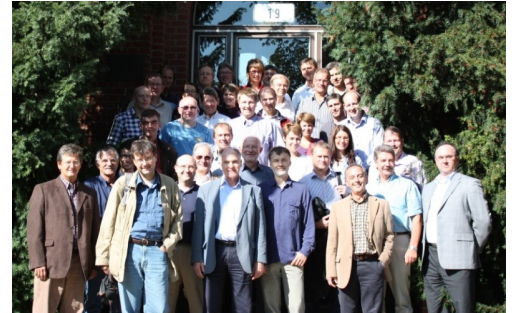
ENDURE members gathered in Berlin to make the final arrangements for this conference.

We hope you thoroughly enjoy the next two days and look forward to interacting with you in the future as ENDURE makes the transition from a Network of Excellence to a permanent European Research Group.