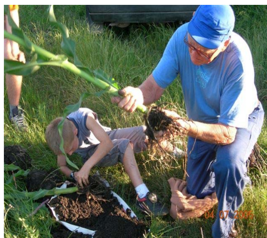
Fig.1: Members of an IPM-FFSs for the WCR, Hungary