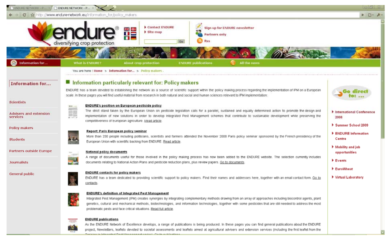
Figure 1: Website section dedicated to policy makers