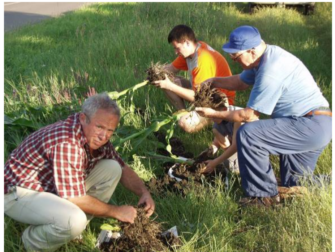
Conducting agro-ecosystem analyses (above left). Participants conduct soil agro-system analyses (above right).