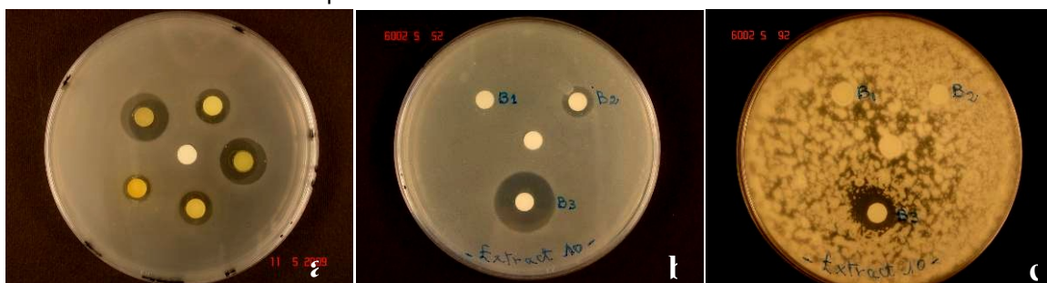
Fig. 3. Antagonistic activity of some crude and partially purified fractions towards Bacillus subtilis (a & b) and Geotrichum candidum (c).