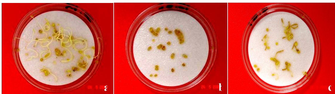
Fig. 1. Effect of crude plant extracts and partially purified fractions on seed germination and seedlings of C. campestris . a/ control; b/ complete inhibition of seed germination; c/ reduced growth and necrosis of the seedlings.